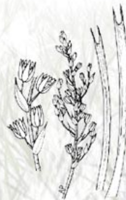
Scented Iron Grass

Gouger (1838) about the plains of South Australia in 1837