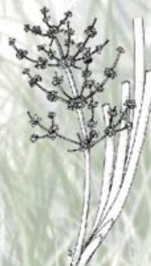
Hard Iron Grass

A tussock of tough narrow blue-green leaves, often with a twist, and with sharp double-pointed tips. White flowers are found low down in the tussock in autumn and winter. The flowers have a strong perfume. Widespread in grasslands.